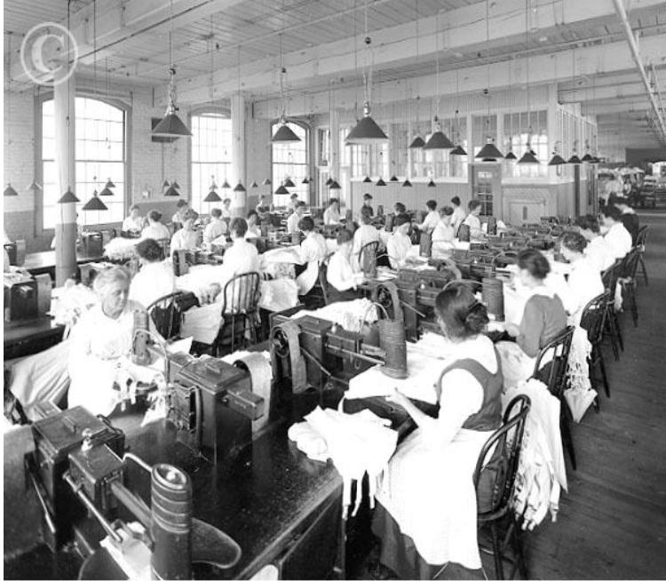
Women sewing in a sweatshop—1900

Directions: Base your answer to question 22 on the documents below and your knowledge of social studies.