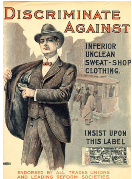
Labor Union Poster-- 1900

22. Based on the documents above and your knowledge of social studies, describe one goal labor unions fought for in the 1900s.